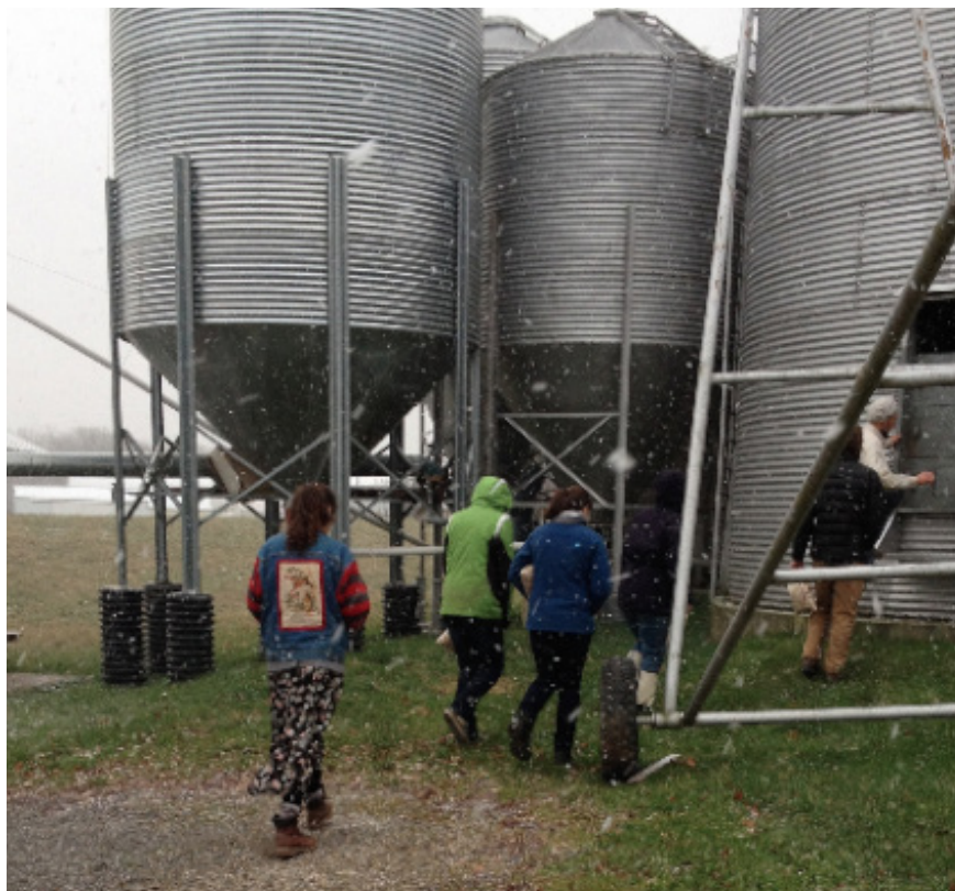
2013-2014 local foods field trip