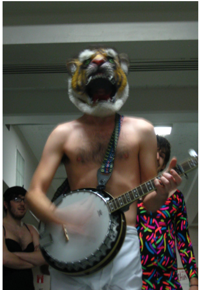
Hark pageant 2011