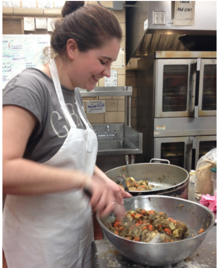
cooking in Fairkid (Fall 2013)